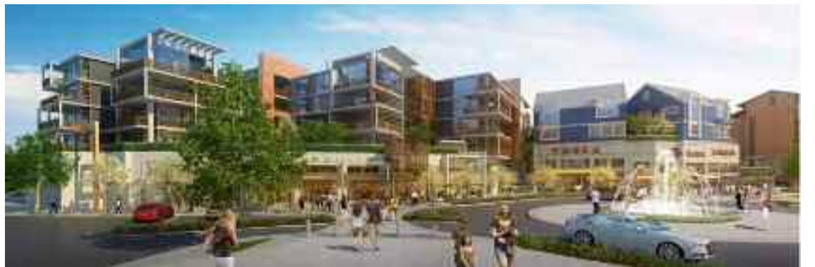
This conceptual rendering shows what Saranap might look like in the future.

Impact Report, finding “numerous deficiencies” and “inaccurate conclusions” in the report.