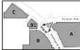
Saranap as it appears today.